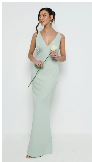
Esmee V-Neck Crepe Maxi Bridesmaid Dress - Sage Village Price € 89