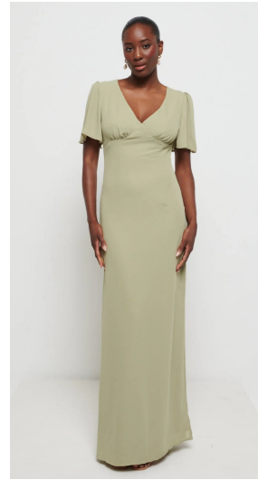
Edie Chiffon Maxi Bridesmaids Dress - Olive Village Price € 84