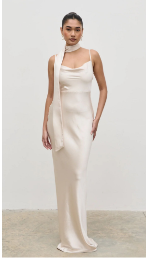
Keisha Maxi Bridesmaid Dress - Matte Champagne Village Price € 84