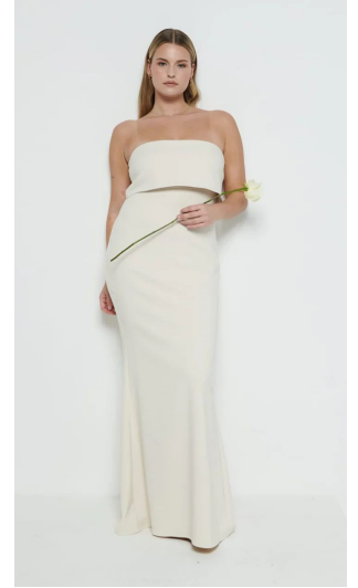
Julia Strapless Crepe Maxi Bridesmaid Dress - Champagne Village Price € 84