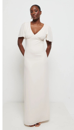
Edie Chiffon Maxi Bridesmaids Dress - Champagne Village Price € 84