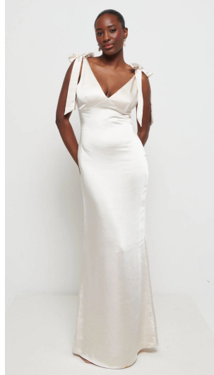
Piper Maxi Bridesmaid Dress - Matte Champagne Village Price € 84