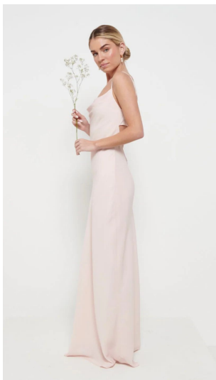
Keisha Chiffon Maxi Bridesmaid Dress - Blush Village Price € 84