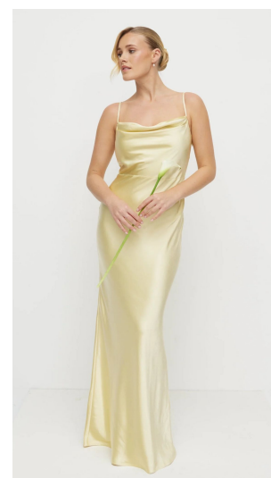
Keisha Maxi Bridesmaid Dress - Lemon Village Price € 130