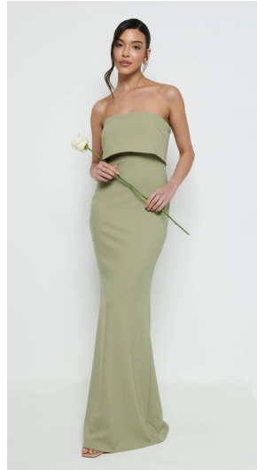
Julia Strapless Crepe Maxi Bridesmaid Dress - Olive Village Price € 89