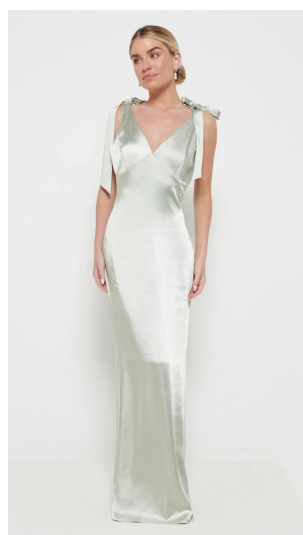
Piper Tie Maxi Bridesmaid Dress - Matte Sage Village Price € 84