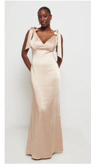
Piper Maxi Bridesmaid Dress - Matte Bronze Village Price € 84