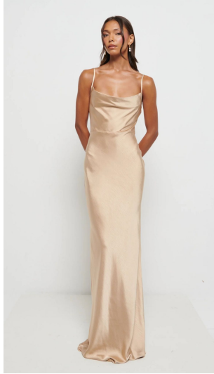
Keisha Maxi Bridesmaids Dress - Matt Bronze Village Price € 114