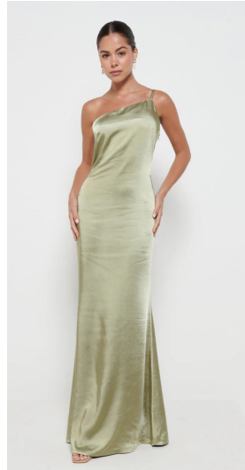
Amelia Maxi Bridesmaid Dress - Matte Olive Village Price € 84