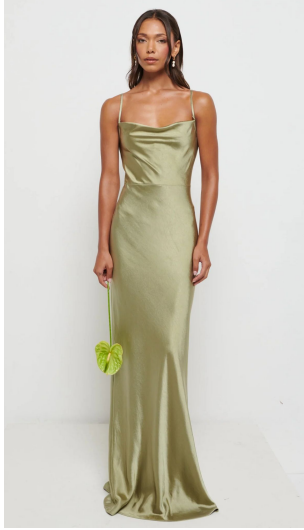
Keisha Maxi Bridesmaid Dress - Matte Olive Village Price € 84