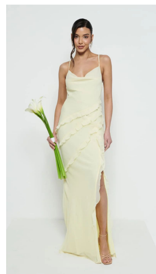
Constance Ruffle Chiffon Maxi Bridesmaid Dress - Lemon Village Price € 134