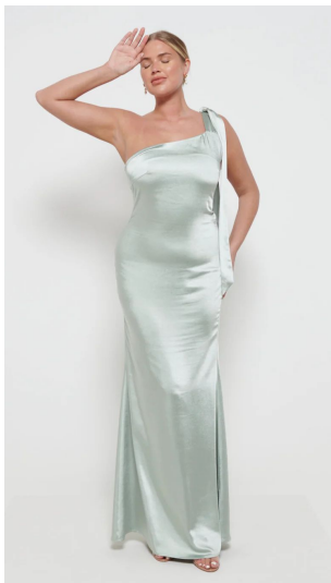
Amelia Tie Maxi Bridesmaid Dress - Matte Sage Village Price € 84