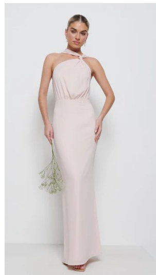
Milly Chiffon Bridesmaid Dress - Blush Village Price € 86