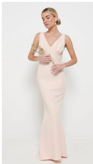
Esmee Crepe Maxi Bridesmaid Dress - Blush Village Price € 89